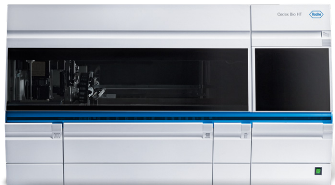
Cedex Bio HT Analyzer

We developed this approach also because we have many different researchers in the lab, working on a number of different projects. The touchscreen user interface on the Fluent workstations makes it very easy for people to walk up and use the systems with only minimal training – we have around 30 users – with a couple of ,key users‘ to handle protocol development and maintenance tasks. All together it’s a great fit to our needs.“